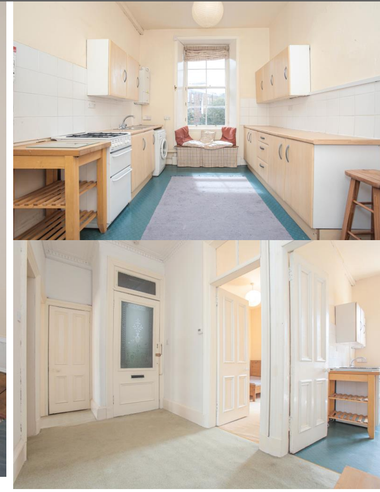
Flat 2/I, 311 West Princes Street, Glasgow, G4 9DR

This well presented, bright two-bedroom apartment on the second floor of a traditional blonde sandstone tenement, is situated in a sought-after pocket of Glasgow's West End in the Woodlands area. This charming flat retains period features throughout and offers spacious and flexible accommodation. Secure door entry leads to a well-maintained communal entrance close and stairs to all floors. The property opens into a spacious and welcoming entrance hall with doors to all apartments. The outstanding bay windowed lounge is bright and spacious with a contemporary fire and ornate cornicing and wooden floors. The kitchen is well sized and benefits from a dining area nook. There are a selection of wall and floor mounted units, a hob, oven and a fridge freezer. There are two bedrooms within the property; the master with an impressive two section window has an en-suite shower room with contemporary shower, vanity and WC, and the second bedroom is a good sized double. The accommodation is completed with a modern, full tiled bathroom with shower bath. The accommodation further benefits from gas central heating throughout, traditional sash and case windows and on street permit parking.