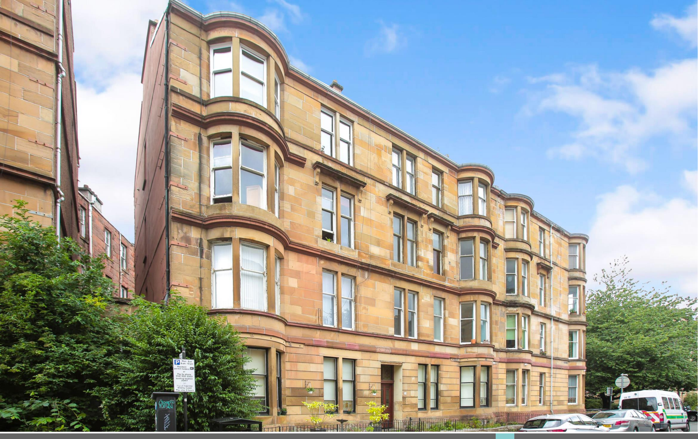
Flat 2/1, 311 West Princes Street Glasgow | G4 9DR